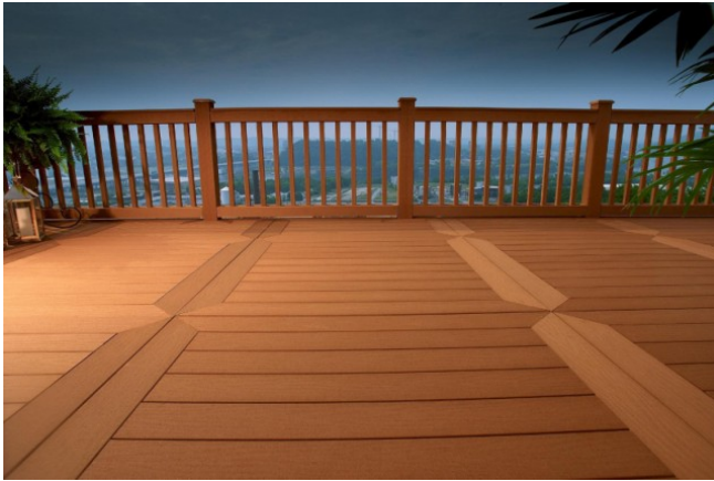
Photo of installed decking

Consumer Contact: For additional information, contact LP toll-free at (888) 325-1184 between 6 a.m. and 5 p.m. PT Monday through Friday, or visit the firm's Web site at www.deckingnotice.com